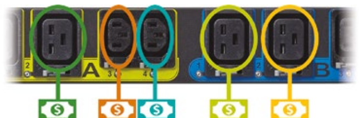
Each outlet can be billed separately.

Metering at the outlet level provides customer-level energy tracking and turns power billing into a revenue stream that considers actual usage. Similarly, you can measure power usage per application and assign it to specific departments for budgeting purposes or to justify costs.