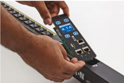
Module being removed without removing power to the ePDU

OU models feature a hot-swap eNMC (ePDU Network Management and Control) module that can be replaced without the need to power down your rack. Increase uptime while enhancing serviceability and saving on unnecessary service calls. The menu-driven pixel display allows for easy setup and troubleshooting.