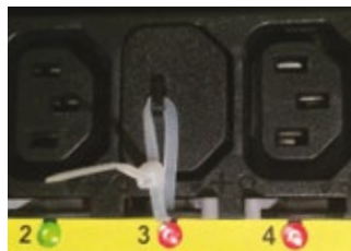
Cap secures in place with cable tie