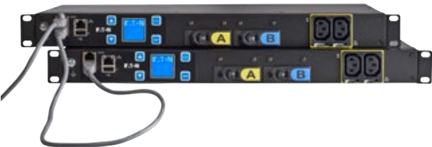
A and B power PDU sharing a network connection via daisy chain

Eaton's new patented daisy-chain capability allows up to eight ePDUs to share the same network connection and IP address. Unlike competitive rack PDUs that require a dedicated IP address for best performance, Eaton technology provides a 87.5 percent reduction in network infrastructure costs.