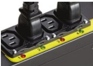
Green LED signifies power on and red is power off to outlet