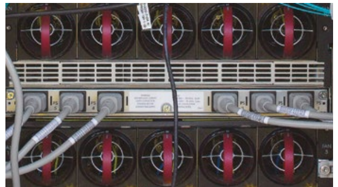
Typical server with multiple power inputs powered by two ePDUs

When connecting multiple source input servers to an A and B feed power source, the daisy-chain capability allows you to group power supplies across the rack PDU. As a result, all power supplies are controlled with a single action, which saves time rebooting servers with two to six power supplies.