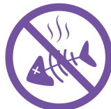
Eliminates odors and chemical contaminants