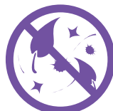
Eliminates volatile organic compounds (VOC)