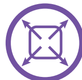
Purifies up to : 4,000 sq.ft.