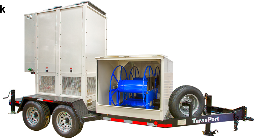
Shown above: LT2500 with optional trailer and motorized cable reels

Load Banks Direct, LLC is a leading manufacturer of high-capacity Load Banks. The LT Series of Load Banks offer a durable approach to those requiring a mobile testing solution. The LT Load Bank is supplied as a complete "Trailer-Ready" assembly suitable for mounting to a customer supplied 7000 or 10000 Pound GVW Highway rated trailer. Looking for a turnkey solution? No problem, LBD can supply an optional trailer that is DOT and ICC road legal and is complete with heavy-duty welded steel construction with steel deck, dual axles, radial tires, electric brakes and lights, adjustable lunette eye, and front/rear stabilizer jacks. LBD is setting the standard for mobile test solutions with rugged construction and intelligent operator controls, safety indication layouts, and adjustable load step resolution.