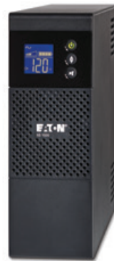
700–1500 VA models with LCD