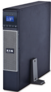
Tower: 1000–3000 VA