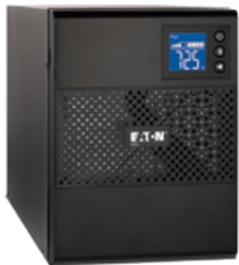
500–1500 VA tower with LCD