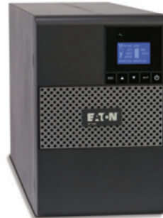
Tower: 750–3000 VA