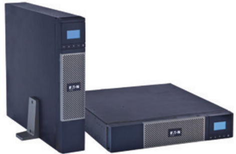
2U rackmount/tower: 1440–3000 VA