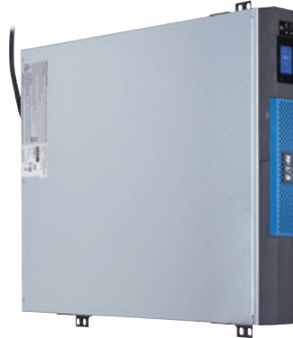
Wallmount: 5P 1500/1550 VA