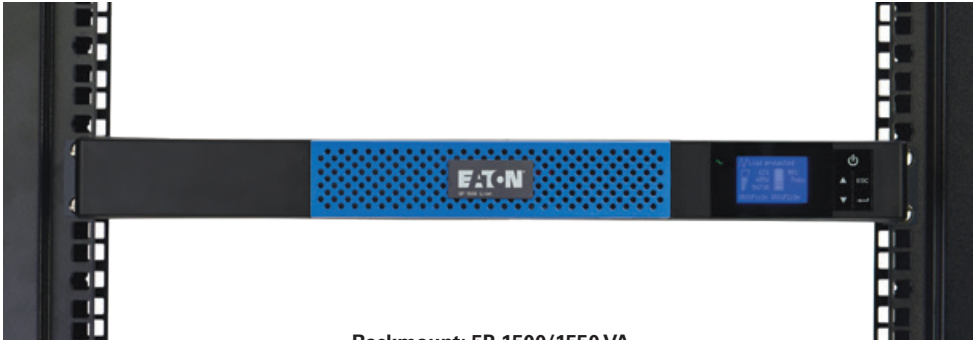
Rackmount: 5P 1500/1550 VA